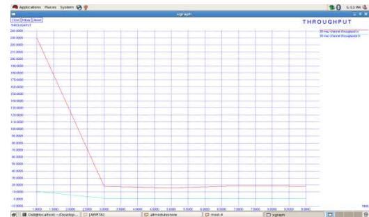
Figure 3. Throughput Graph for 30 nodes of MMAC using AODV and DSDV Routing Protocol