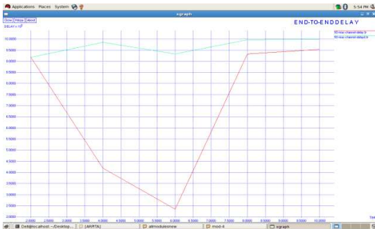
Figure 7. End to End delay Graph for 50 nodes of MMAC using AODV and DSDV Routing Protocol