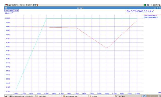
Figure 5. End to End delay Graph for 10 nodes of MMAC using AODV and DSDV Routing Protocol

Fig 5, 6, 7 shows the end to end delay of different protocols as the network load increases 10, 30, and 50 respectively. In case of AODV routing protocol, the packets started dropping from the start when ad-hoc network contain 10 nodes. For certain time interval AODV routing protocol dropping packet more than DSDV when 10 nodes are considered. Similarly in other Ad-hoc network contains 30 and 50 nodes, the packets started dropping in case of DSDV is more because number of packet lost are more endless in AODV routing protocol.