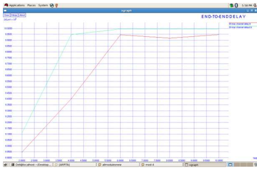
Figure 6. End to End delay Graph for 30 nodes of MMAC using AODV and DSDV Routing Protocol