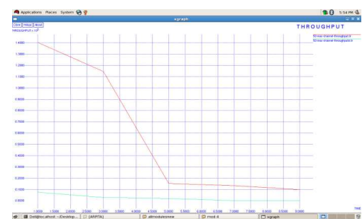
Figure 4. Throughput Graph for 50 nodes of MMAC using AODV and DSDV Routing Protocol

Fig 5, 6, 7 shows the end to end delay of different protocols as the network load increases 10, 30, and 50 respectively. In case of AODV routing protocol, the packets started dropping from the start when ad-hoc network contain 10 nodes. For certain time interval AODV routing protocol dropping packet more than DSDV when 10 nodes are considered. Similarly in other Ad-hoc network contains 30 and 50 nodes, the packets started dropping in case of DSDV is more because number of packet lost are more endless in AODV routing protocol.