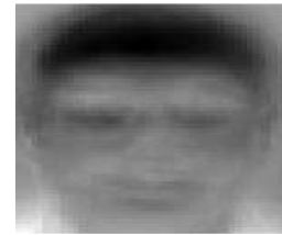
Figure 4 . Eigen Face.

the 40 template eigen faces with the highest degree of fit are necessary to reconstruct the face with the accuracy of 99 percent. The whole thing is done using Face Recognition softwares.