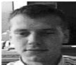
Figure 3. Normalized face.

The face region is rescaled to a fixed pre-defined size (e.g. 150-100 points). This normalized face image is called the canonical image. Then the facial metrics are computed and stored in a face template. The typical size of such a template is between 3 and 5 KB, but there exist systems with the size of the template as small as 96 bytes. The figure for the normalized face is given below.