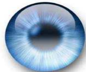
Figure 5. Image of IRIS

This recognition method uses the iris of the eye which is colored area that surrounds the pupil. Iris patterns are unique and are obtained through video based image acquisition system. Each iris structure is featuring a complex pattern. This can be a combination of specific characteristics known as corona, crypts, filaments, freckles, pits, furrows, striations and rings. An IRIS Image shown in figure 5.