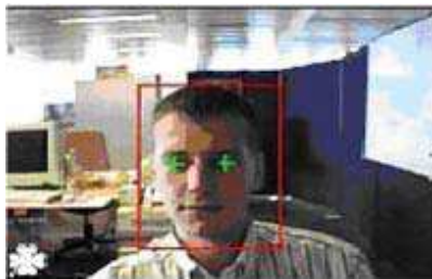
Figure 2. Recognition of face from Body.

A facial recognition technique is an application of computer for automatically identifying or verifying a person from a digital image or a video frame from a video source. It is the most natural means of biometric identification. Facial recognition technologies have recently developed into two areas and they are Facial metric and Eigen faces. Facial metric technology relies on the manufacture of the specific facial features (the system usually look for the positioning of eyes, nose and mouth and distances between these features), shown in figure 2 and 3.