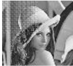
Fig.6. shows the final output (watermarked image)