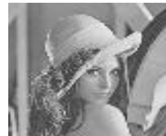
Fig.3 shows the lena image