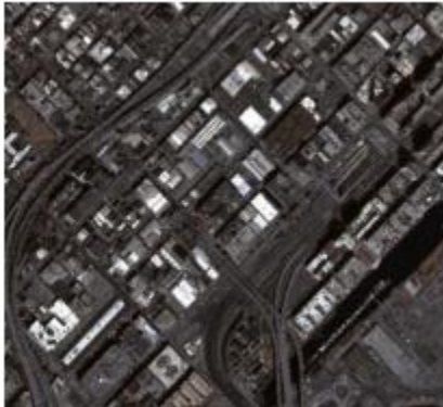
Figure 1: Pan-Sharped of the Case Study Area

4.1. Pan- Sharped Image Multi-spectral and panchromatic images of Quick bird obtained by Asturim service in October 2011 with a resolution of 2 m and 0.5 m were used through this investigation. By coregistration of these two images, four bands raster file with a resolution of 0.5 m were obtained. Pan- Sharped image of the under study area is shown in Figure 1